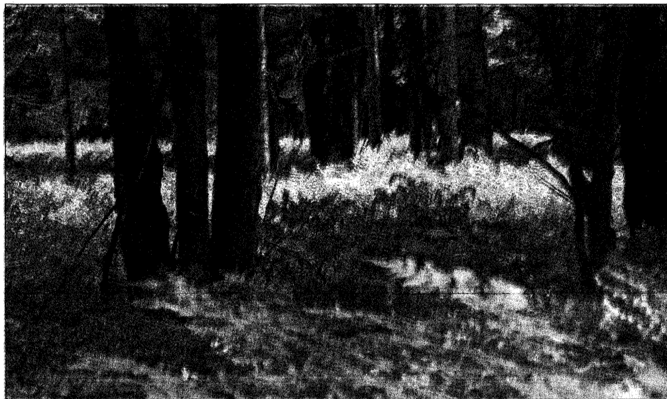
If the ferns are turning, can fall colors be far behind?