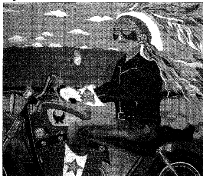
Skeleton custom bike, sculpture stainless steel, by Dozer, Auburn Hills.