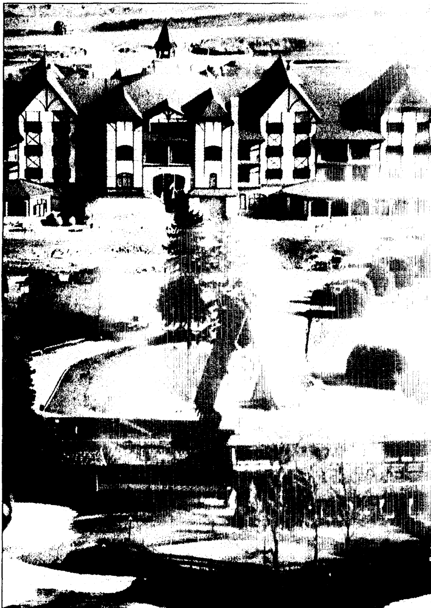
The view from the top gets more impressive at Boyne Mountain, as construction progresses on the Grand Mountain Lodge.

Grice said that a couple of days of hard cold, in the lower 20s or cooler, are needed to really get the snow-making in full swing. As for opening for the Thanksgiving holiday, "we haven't thrown in the towel yet," he said late last week. "We're just waiting for it to turn cold."