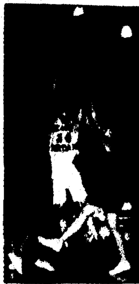
Red Devils make it to district finals — see page 8