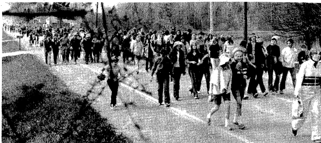
BEGINNING THE WALK - An army of hundreds of walkers, most of them young, head out from Boswell Field along M-32. As the walk progressed, the line got thinner and thinner as some dropped out, some sped ahead, and others lagged behind.

There was lots of good conversation, a congenial community spirit, and several interesting sidelights every mile, a few of which can be seen on these picture pages.