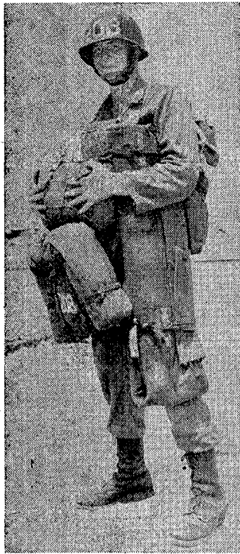
READY TO JUMP