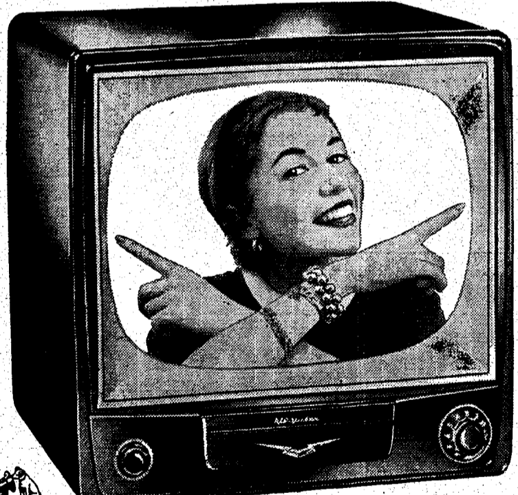
RCA Victor 21-inch Barrance. Shunning table TV in ebony finish. Model 215810. $199.95

It's a fact that 21-inch tubes vary up to 28% in the size of the picture they deliver. There's small-size 21—the regular size 21 and the new RCA Victor Oversize "All-Clear" Picture—today's biggest, finest picture in 21-inch TV! It's TV's clearest picture, too—thanks to RCA Victor's aluminum "All-Clear" picture tube that gives you up to 212% greater picture contrast! You can enjoy big-screen TV—and all the other RCA Victor TV advances—in a wide variety of exciting new models—at the lowest prices in RCA Victor history! Now's the time to buy—RCA Victor's the set to buy! Come in today and see what you've been missing. FOR UHF —New High-Speed UHF Tuner is 8 times faster than previous continuous tuner! (Optional, at extra cost.) Ask about the exclusive RCA Victor Factory-Service Contract.