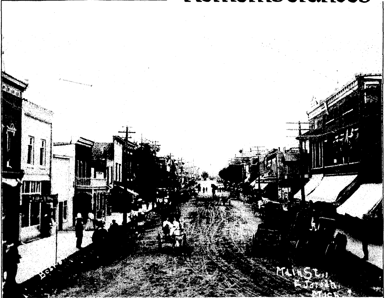
This charming picture of the main street of East Jordan in the 1900s seems same scene about 30 years later. If you have any old pictures of the East to bring the onlooker into the scene for a walk up and down the sidewalk to Jordan, Boyne Falls, Boyne City area you would like to share with our great friends. Do you think this picture was taken on a Saturday morning? readers, please bring them to the office so we may copy them and return just look at all the various types of carriages and wagons during their them to you. owners attending to weekly business. Next week we plan to bring you the