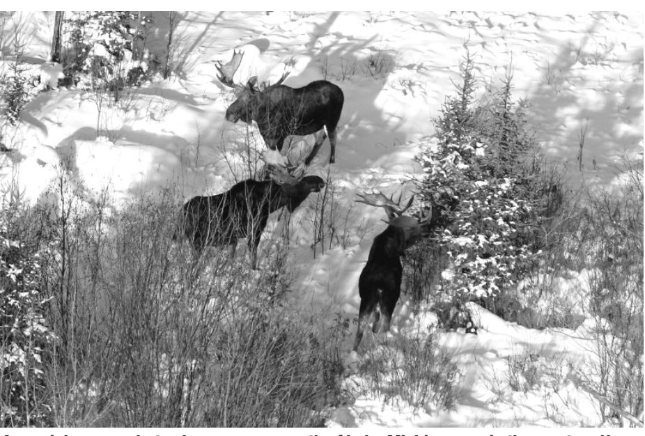
An aerial survey photo shows moose south of Lake Michigamme in the western Upper Peninsula.

Canada in the mid-1980s." The western U.P. moose range covers about 1,400 square miles in parts of Marquette, Baraga, and Iron counties. The eastern U.P. population of moose is not surveyed but is esti-