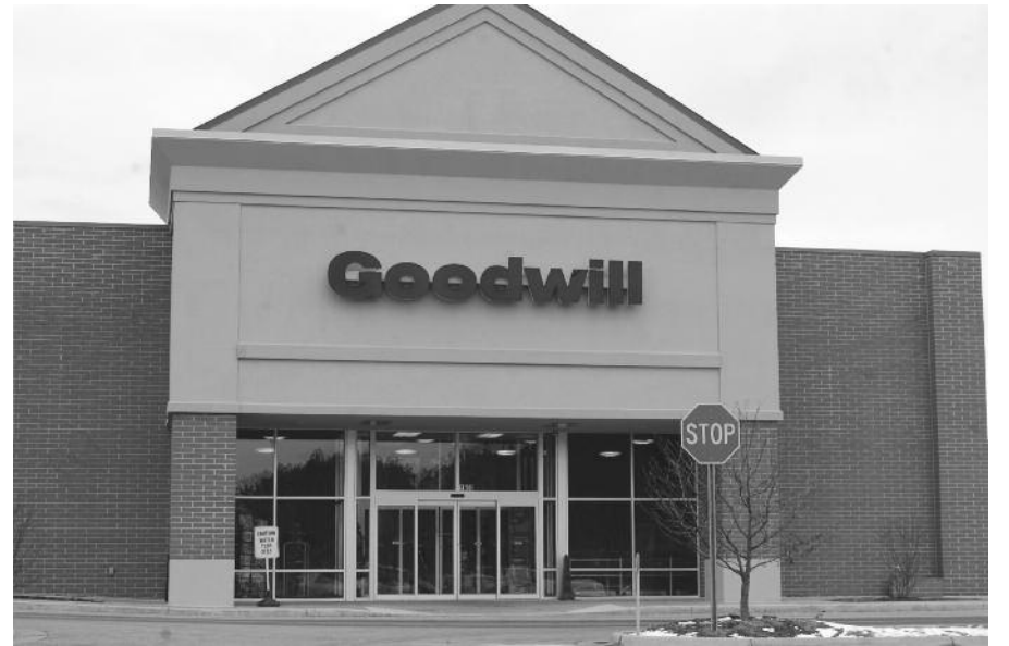
The 6,700 square foot Goodwill Retail and Donation Center in Petoskey is located at 1600 Anderson Road.