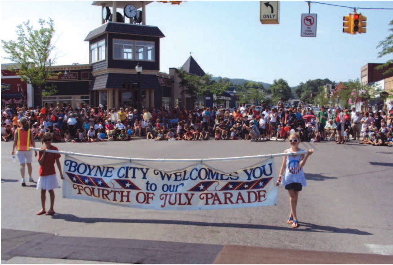
An action-packed week of Boyne City 4th of July Festival fun begins this Sunday, July 1st, and a highlight of the exciting week ahead is the Grand Parade which will take place on Wednesday, July 4th starting at 10 am.

The Soap Box Derby School is the one addition to the schedule of events this year and will be offered July 3 at 1 p.m. Those who