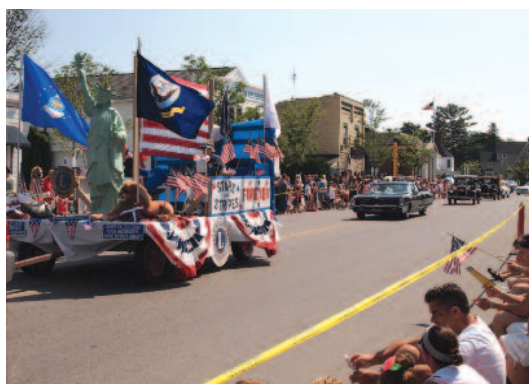
This coming week communities throughout Charlevoix County will celebrate our freedoms with parades, fireworks and an assortment of festivities commemorating our nation's 236 years of democracy.