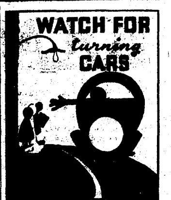
HIGHTH NATIONAL TRAFFIC SAFETY POSTER CONTEST

The stainless steel flatware on the market now is a combination of iron, nickel and chromum making it tough and tarnish-proof say onomists.