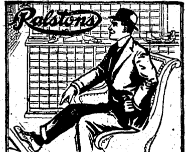
Another Pair Just Like These

Alas, the honeymoon was indeed over! That morning they had come to words over breakfast and he had departed for the city in a rage. As the day passed he began to think that, perhaps, after all, he had been rather hasty. So as he wended his way homeward he carried a small but interesting parcel. To his amazement, his little wife refused to take the slightest notice of it—and him. "Don't you want to see what's in my parcel, darling?" he pleaded wistfully. "I expect I can manage to survive not knowing," she retorted coldly. "Well," he said playfully, "it's something for somebody I love more than all the world." The lady's face brightened up. "Really?" she said. "Then I suppose it's the cigarette case you've been wanting so long."